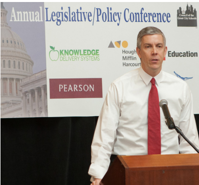
U.S. Secretary of Education Arne Duncan praises big-city schools at the 2014 Council's Annual Legislative/Policy Conference.

“None of your districts are adequately served, but year after year the improvement we are seeing across your school districts is actually helping lead the country where it needs to go. Thank you collectively for the difference you are making.”