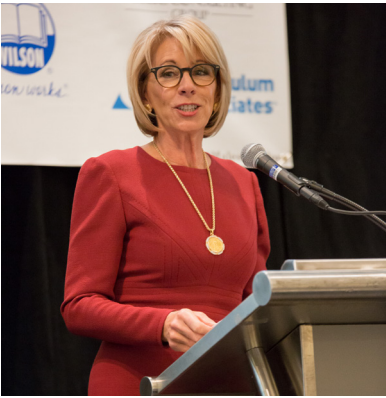
U.S. Secretary of Education Betsy DeVos at the Council's 2017 Annual Legislative/Policy Conference.

Spring Legislative and Policy Conference: a forum held in Washington, D.C. each spring for the membership to discuss recent developments in federal legislation and funding and to advocate the policy positions of urban public schools.