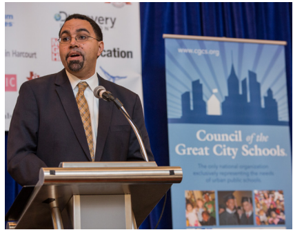
U.S. Secretary of Education John King at the Council's 2016 Annual Legislative/Policy Conference.