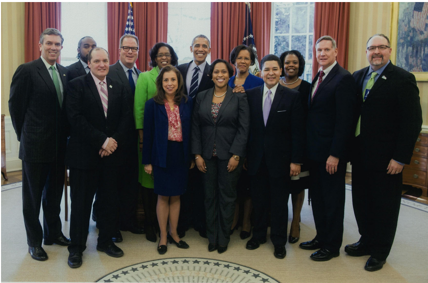
Urban school leaders pose with President Barack Obama in the Oval Office after their meeting in March 2015.